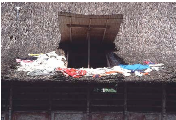
Fig. 2: Skylight windows of a Nias house

This kind of opening is peculiar to the island of Nias and cannot be found elsewhere in the Archipelago.