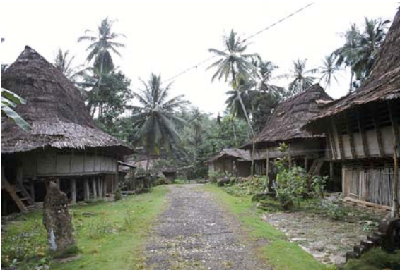
Fig. 1: A Settlement in North Nias

In former times the settlements were fortified with fences of bamboo or with an earth walls overgrown with trees.