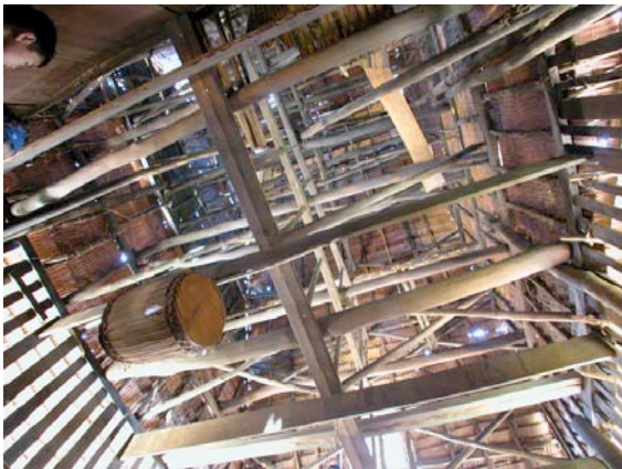
Fig. 12: Roof space in a Central Nias house.

Interviews with the tenants provide information about the history of the buildings and the functions of the rooms. The knowledge of the people can help scientific researchers in many ways. Craftsmen know about the material and the construction in detail and the tenants can give essential information about the building and its significance. Information gained from local people will be essential to avoid misinterpretation and to define changes in architecture, typology and use through the recent earthquakes.