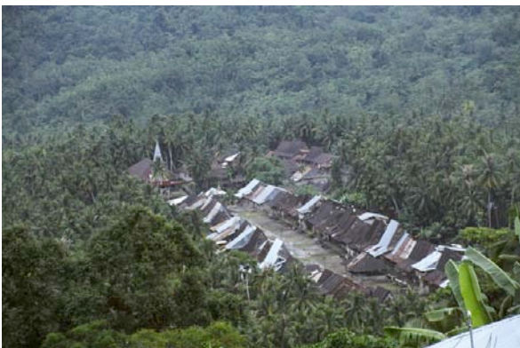
Fig. 7: Settlement in South Nias

Villages in South Nias are situated on hills and are named after their location. In the past, when warfare and headhunting raids were endemic, an outer palisade of sharpened bamboo stakes fortified the village with a deep ditch behind.