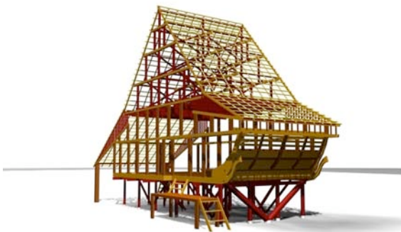
Fig. 13: 3d Model of a South Nias house

Interviews with the tenants provide information about the history of the buildings and the functions of the rooms. The knowledge of the people can help scientific researchers in many ways. Craftsmen know about the material and the construction in detail and the tenants can give essential information about the building and its significance. Information gained from local people will be essential to avoid misinterpretation and to define changes in architecture, typology and use through the recent earthquakes.