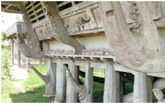
Fig. 6: Decoration in Central Nias

The hybrid typology of the Central Nias houses has not yet been fully examined. Research on its origin and influences on North- and South Nias types will form an important part of our project.