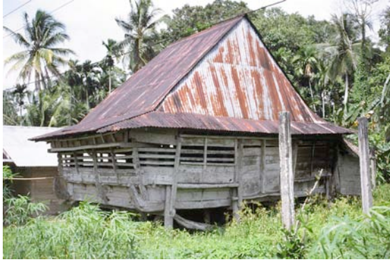
Fig. 5: House in Central Nias

Characteristic features of the architecture especially in Central Nias are decoration and ornamental art. At the fronts samples and animal representations serve as protection for the house and its inhabitants. Other symbols inform about the conditions of the family regarding fertility, for example the number of women living in the house.