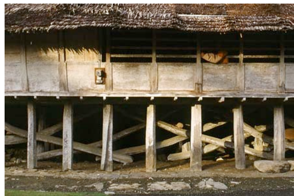
Fig. 4: Foundation of a building in North Nias

The whole building though oval in floor plan, is elevated onto an orthogonal substructure of several rows of pillars and numerous diagonal posts. To maximize the elasticity of the construction the pillars are not settled in the ground but rest on top of stone foundations. This detail is a very common constructive wood protection avoiding the direct contact between wood and earth to make the construction more durable.