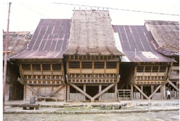
Fig. 9: Facade in South Nias

The standard typology of the South Nias house is a rectangular shaped elevated row house construction oriented with the eaves towards the street. The substructure is made of 4 rows of strong pillars (Ehomo), reaching from ground to first level. Diagonal posts like in North-Nias houses support them. But on the contrary to this typology here the v-shaped columns are situated at the very front, acting as support and as representative element. Again, all house posts rest on foundation stones on one hand to prevent them from rotting and on the other hand to make the construction as a whole more flexible. The space created beneath the house is used for storage and as a stable.