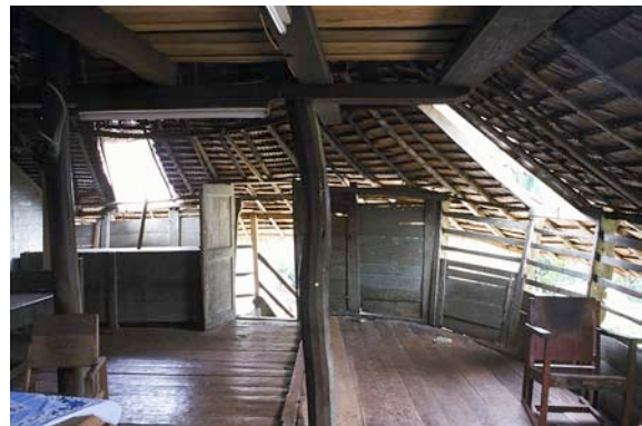
Fig. 3: Light interior

The house is hardly furnished, the inhabitants belongings stored in chests. The most important piece of furniture is a long plank below the louvers, which the tenants use as a bench. From there they overlook the village square and get easily into contact with the people on the street and in other houses. Considering an average of 250 days of rain per year, these views options, together with the big meeting room, enable essential social contact.