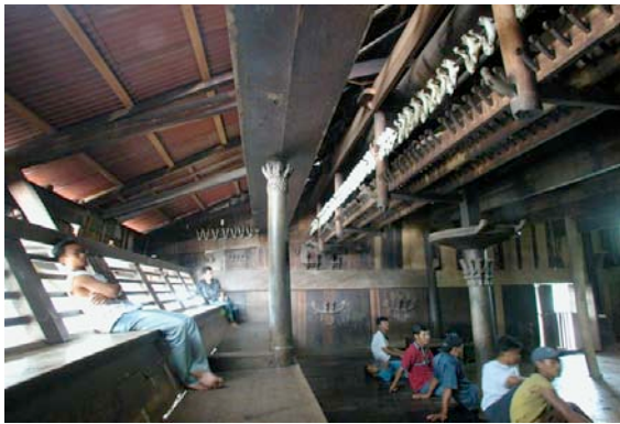
Fig. 10: Interior

furniture is sparse. Constructive elements of the cantilevered front facade create different floor levels in the interior space, being used as benches and for storage purposes.