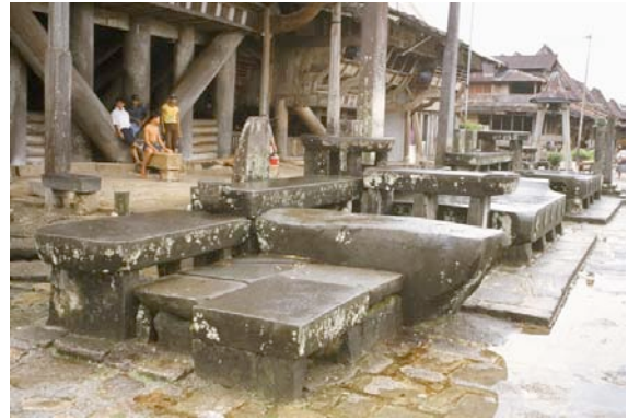
Fig. 8: Nias hosts an important megalith culture

In the covered area in front of the houses along the street semi-public space is used for working, socialising and for transition. A drainage gutter defines the border. The following area towards the street is reserved for the megaliths as representation space. This zone is called "wall of stones" ( öli batu ) and indicates the rank of the householders. The megaliths are a kind of petrified model of the social hierarchy and feasts of merit. The stones are classified by gender, and come in a variety of forms, which include menhirs, benches and circular seats.